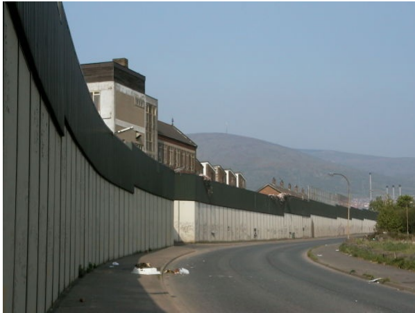
Figure 2: A ‘Peaceline’ in Belfast

Derry/Londonderry where the violence has also been most intense (Fay et al. , 1999; Morrissey and Smyth, 2002; Smyth and Hamilton, 2003). In relation to Belfast, and as illustrated by Figure 2, there are a number of ‘peacelines’ running through these areas where high, reinforced walls have been built to keep neighbouring communities apart. Many of these areas are also clearly marked out politically as either Catholic or Protestant by the existence of such things as: painted kerbstones (red, white and blue to signify Protestant/British neighbourhoods and green, white and orange to signify Catholic/Irish neighbourhoods); the flying of the respective national flags; and painted wall murals and graffiti carrying explicit political (and sometimes sectarian) messages. One such example of this is provided in Figure 3 that shows a not untypical residential area in a strongly loyalist neighbourhood in Belfast.