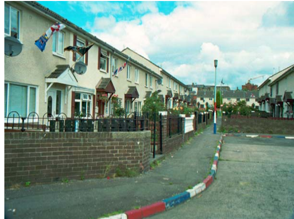
Figure 3: A ‘Loyalist’ Area in Belfast