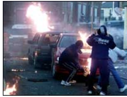
Petrol bomb attacks have taken place over several nights

Petrol bombs and other missiles were thrown at police during Wednesday night's disturbances. The home of a couple aged in their 70s was one of